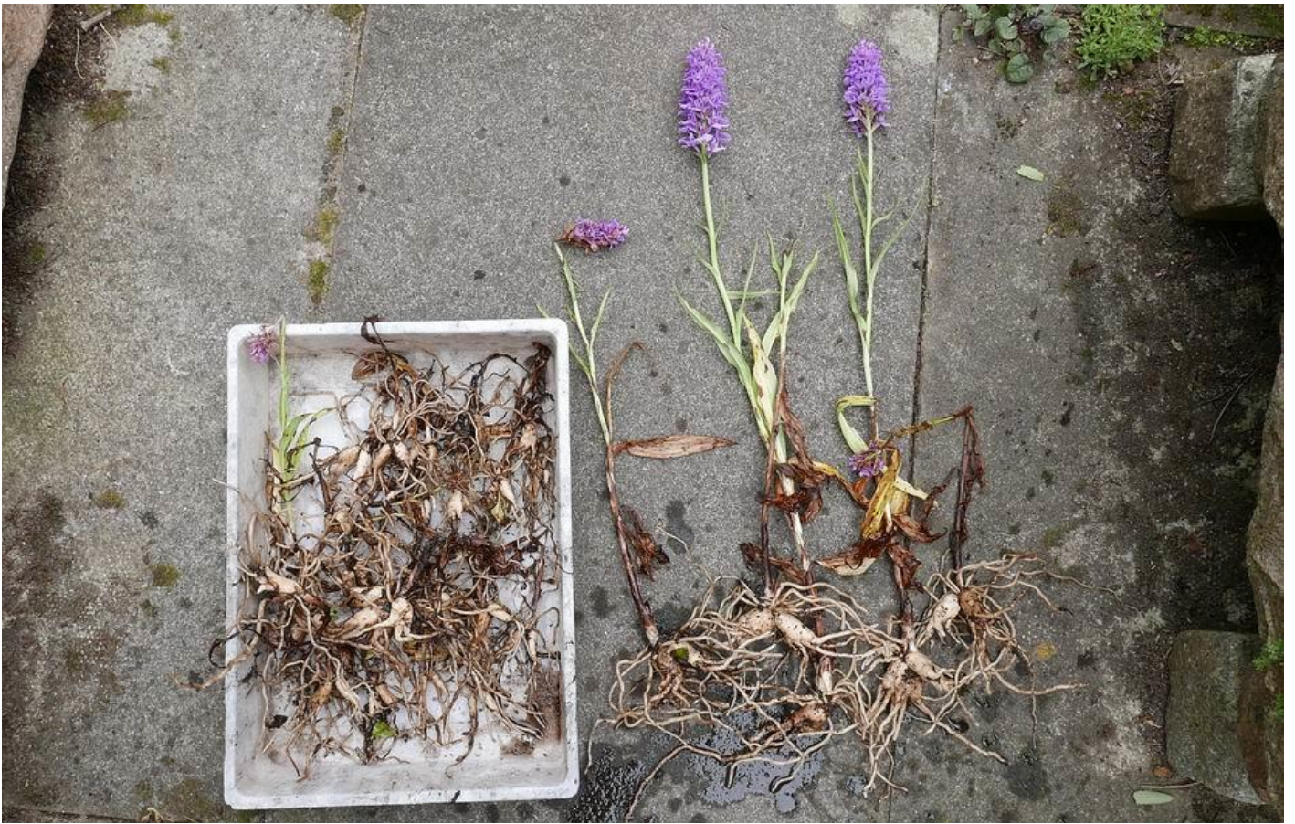
This is the total of the Dactylorhiza tuber removed from this one trough some of which I have planted back into the trough while I have planted the others elsewhere.