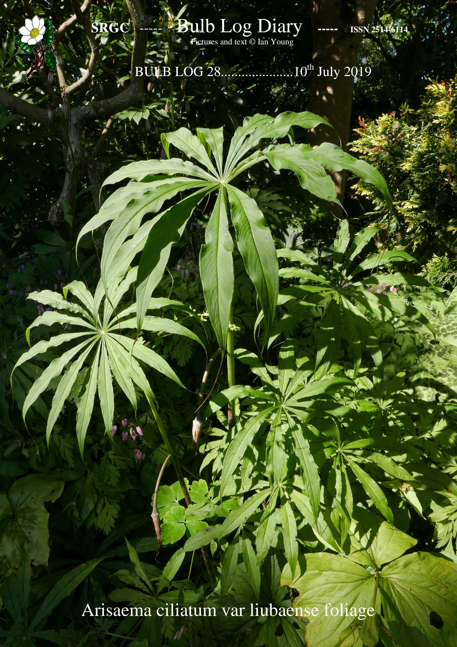
Arisaema ciliatum var liubaense foliage