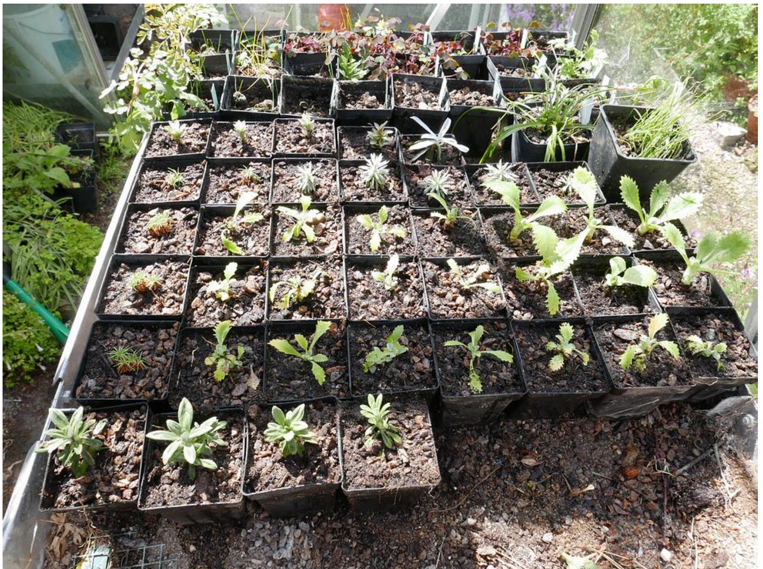
Cuttings potted up with re-used bulb compost.

Regular readers will remember in Bulb Log 2019 I showed the mist propagation unit full of cuttings - these rooted Celmisia cuttings are ready for potting on now and as they will only be grown in pots for a short time I am recycling the compost from the bulb repotting and using that to pot up the cuttings.