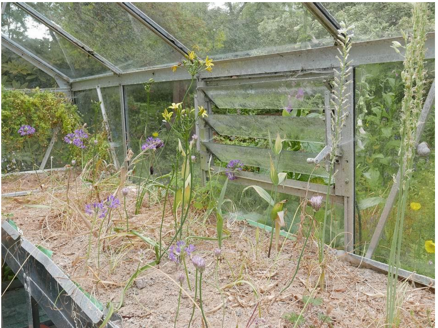
Allium crispum, Allium gomphrenoides, Tritelia ixioides and Ornithogalum sp.

I have been trying to find bulbs for the sand beds that will produce flowers into June and July while tolerating or even thriving in the Mediterranean type regime of winter wet leading on to a dry summer. I seem to be finding a few that are proving suitable bringing the colour of their flowers to that period.