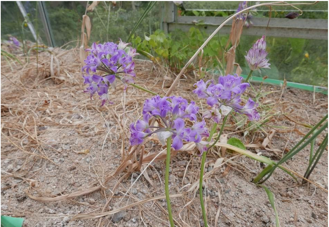
Allium crispum and Allium gomphrenoides

Allium crispum has relatively large petals making them stand out as one of the showiest of these small onions but the complexity of the inflorescences makes them all worthy of the attention of my camera.