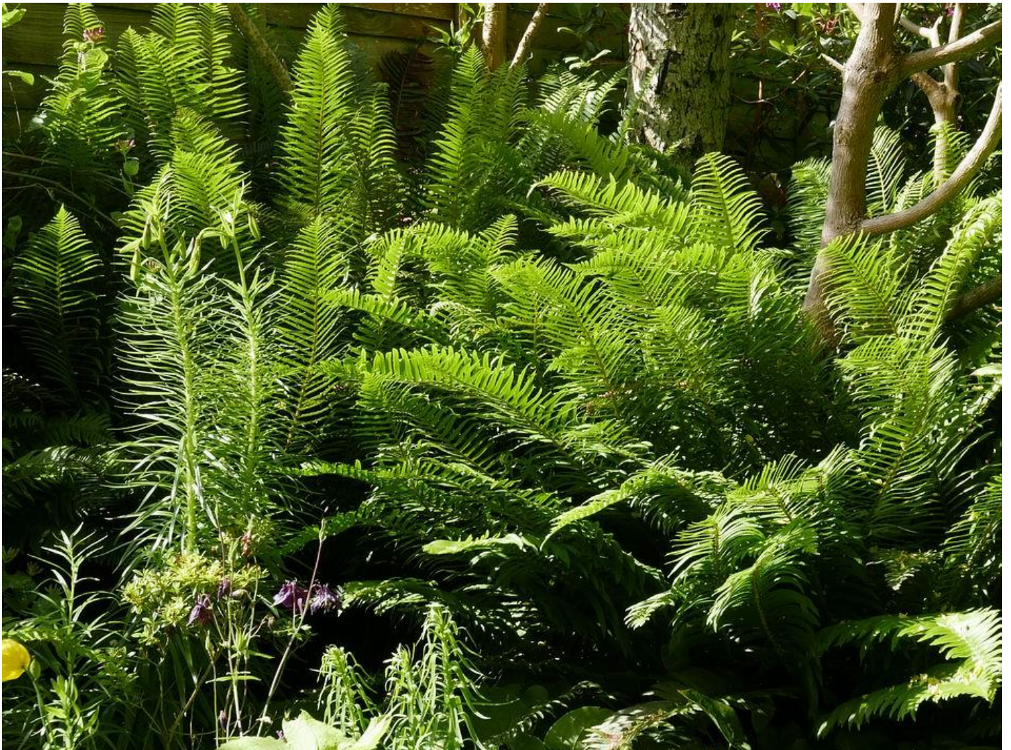
The decorative qualities of ferns should never be underestimated.

The following series of pictures celebrates foliage.