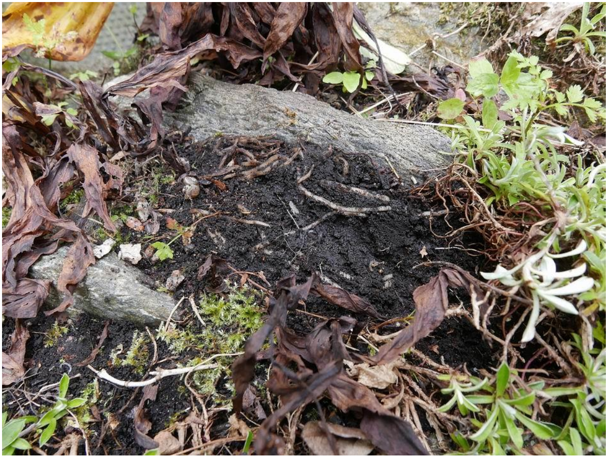
As soon as I started to remove the leaves to get the rocks out of the trough I saw a mass of healthy Dactylorhiza roots almost at the surface