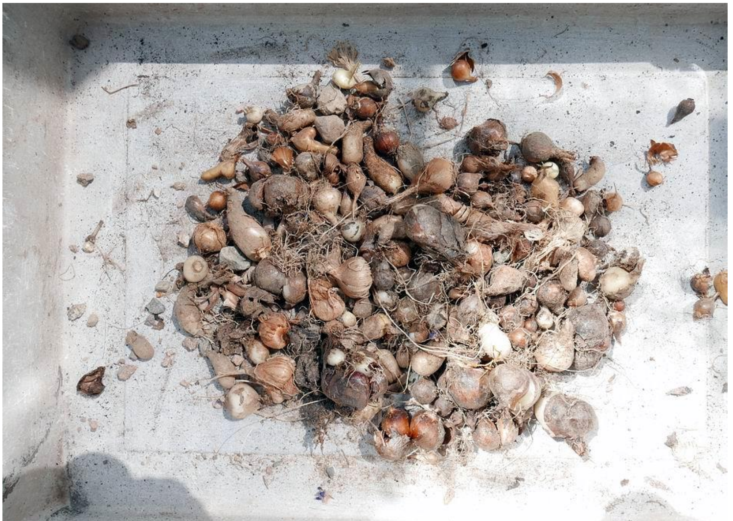
All these bulbs came out of that one 30cm square area.