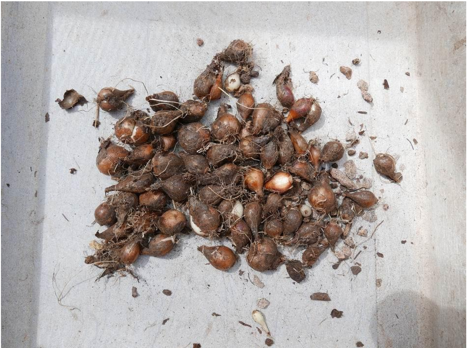
Contents of one pot of Narcissus bulbs before being cleaned up.

The two large bulbs above came from a good depth in the sand bed while the mass of tiny ones are the result of that bulb being planted too near the surface where it dries out more causing the bulb to break down into many smaller ones.