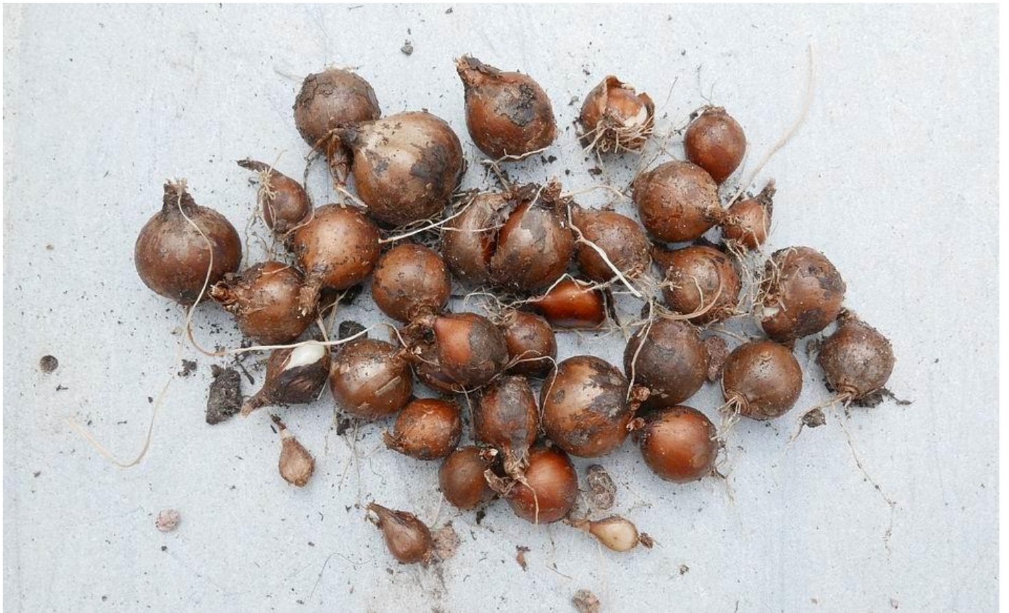
The same bulbs now tidied up , with the largest selected to be replanted immediately as shown below.