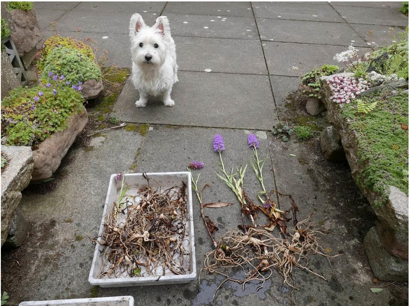
As always Molly oversees the process.