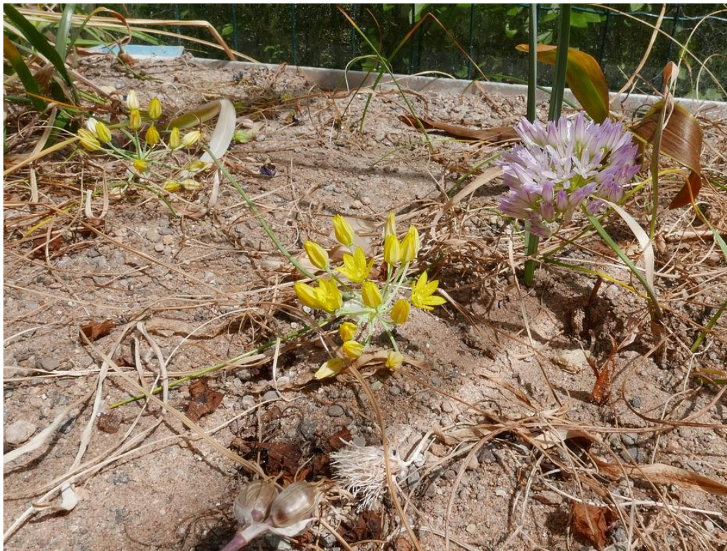
Triteleia and Allium parvum

Allium crispum has relatively large petals making them stand out as one of the showiest of these small onions but the complexity of the inflorescences makes them all worthy of the attention of my camera.