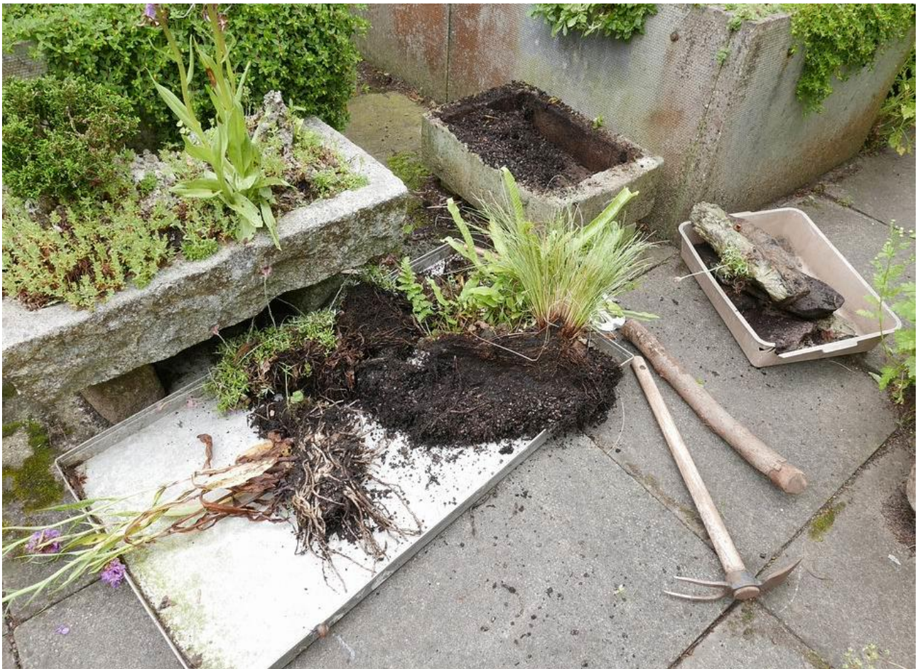
Trough with contents removed

I am returning to the subject of the damage to the Dactylorhiza namely the browning and dying back of the stems and leaves of some of the plants, such as in this trough, which I have decided to investigate further.