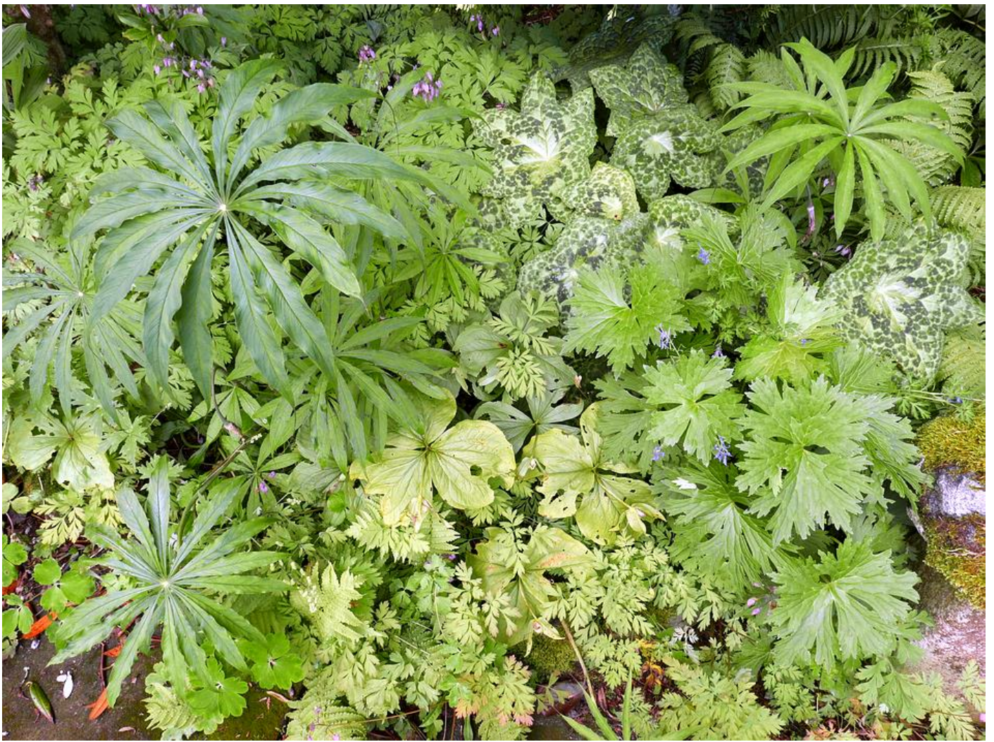
High cloud cover gives a flat light which greatly reduces the contrast allowing us to appreciate the mixed shape, form and texture of the greenery which includes Aconitum, Aquilegia, Arisaema, Dicentra, Podophyllum, Trillium and ferns.