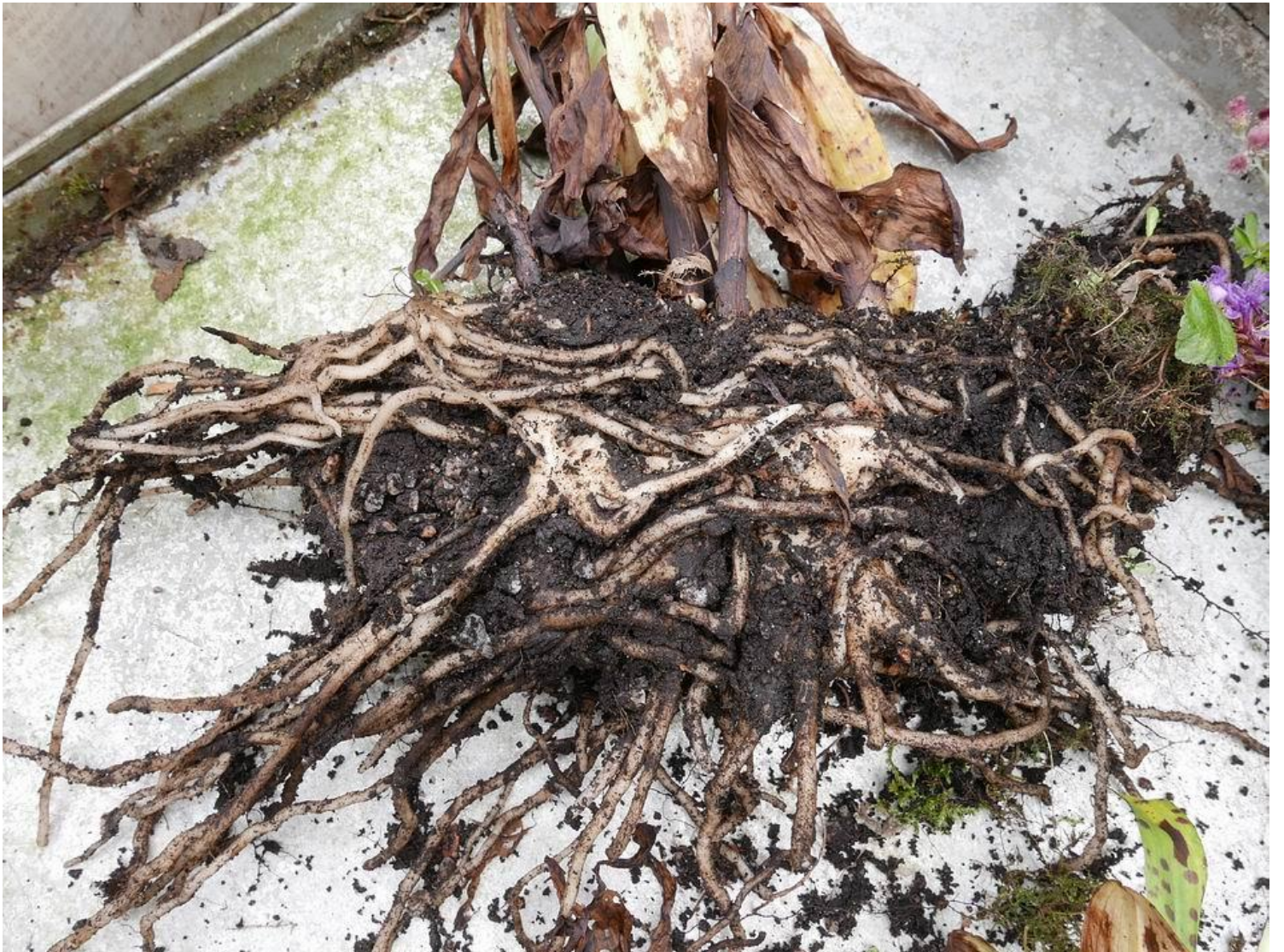
Once I got them out I can see that the tubers and roots were, as I suspected, very congested and pressed against the rocks.