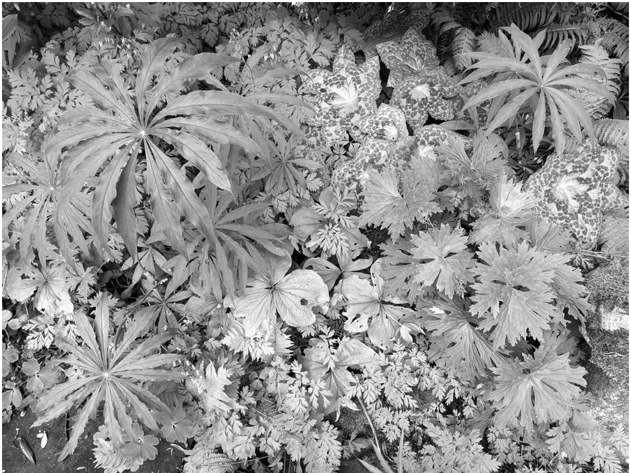
Removing the colour allows us to appreciate the form and tones.